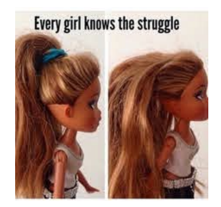
Step 1: Take out your ponytail if your hair is up!