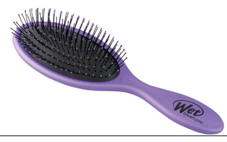
Step 2: Take your hairbrush and gently comb out the ends of your hair.

Then move to the top of your hair and brush all of it.